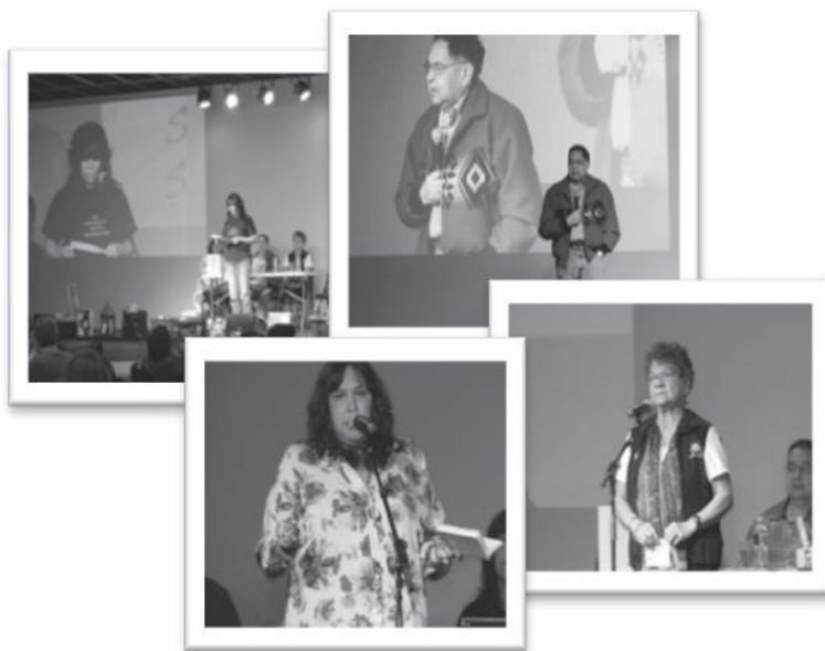
Key note speakers share their strength and courage at the Family Conference