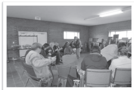
Aboriginal Cultural Training March 8, 2012 at Sumas First Nations

A variety of stakeholders participated including School District Staff from four school districts, Ministry of Children and Family Development, Community Services from various regions, Spirit of the Children, Big Brothers Big Sisters, Abbotsford Police, private organizations such as Empowered by Horses, and foster parents.