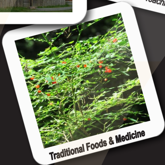
Traditional Foods & Medicine

WE ARE PLEASED TO ANNOUNCE THE UPCOMING ABORIGINAL CULTURAL TRAINING OPPORTUNITY. This informative day will provide participants with a greater understanding of the history of the migration of the Stó:lō people through their traditional territory. They will also increase their awareness and knowledge of First Nations and Métis culture within the Fraser Valley.