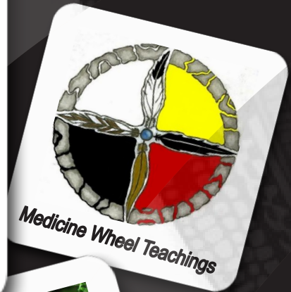
Medicine Wheel Teachings